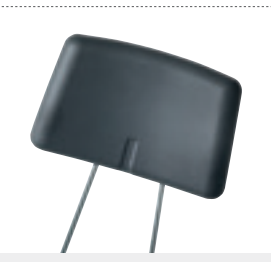
Adjustable headrest Art. No. 947 013