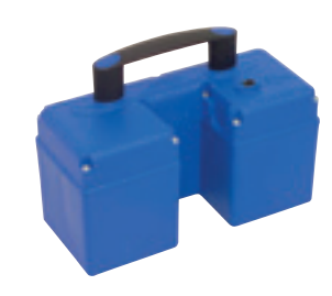
Quick-change battery unit BU PT 5,2 Ah weight 4.3 kg, capacity 5.2 Ah, voltage 24 VDC Art. No. 004 150