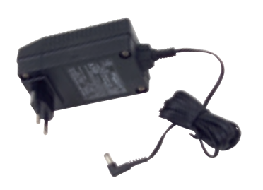
Mains charger unit BC-PT with Euro plug Art. No. 045 141

Accessories for LIFTKAR PT stairclimbers are specifically designed to cater for the individual needs and requirements of people with walking difficulties. The quality of the technical solution and design are of the utmost importance.