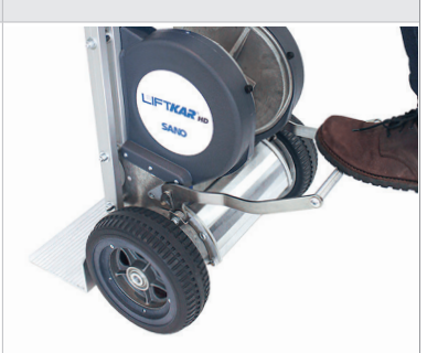
Tilting lever HD complete ** Art. no. 960 128