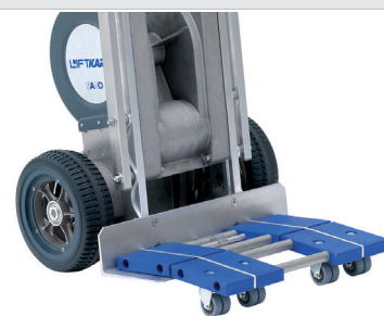
Toe plate attachments ** (Width x Depth) equipped with four double castors. Toe plate Narrow, 464 x 345 mm, Art. no. 960 101 Toe plate Wide, 535 x 345 mm, Art. no. 960 105 Toe plate XL, 535 x 550 mm, Art. no. 960 139 Toe plate XL Narrow, 464 x 550 mm, Art. no. 960 144