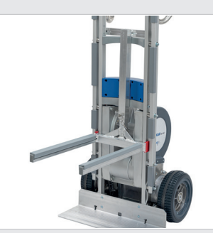
Chair holder ** Art. no. 960 125