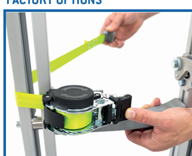
Ratched strap with roll-up mechanism 2,5 m *** Art. no. 930 193