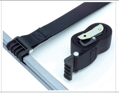
Safety straps SB-HD ** with special hook for safely secure load. L 3,5 m, B 50 mm, Art. no. 930 123* L 4,2 m, B 50 mm, Art. no. 930 156