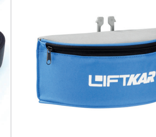
Bag incl. holder for belt, charger, and much more. blue, Art. no. 935 140 red, Art. no. 935 146